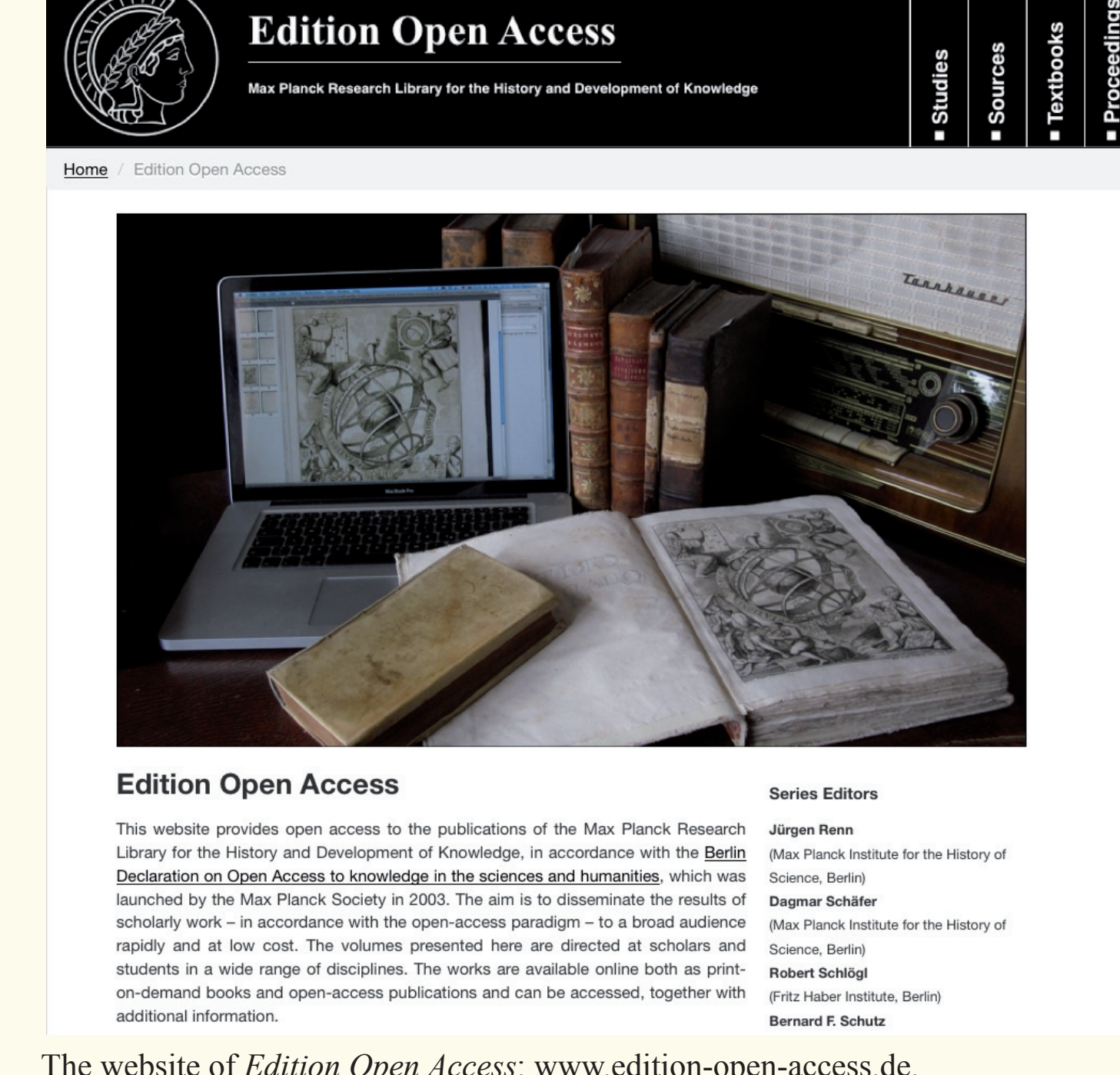
The website of Edition Open Access : www.edition-open-access.de.

EOS features volumes that are based on content relevant to the history and development of knowledge. They present primary materials in facsimile, transcription, or translation. The original sources are complemented by an introduction and by commentaries that communicate original scholarly work.