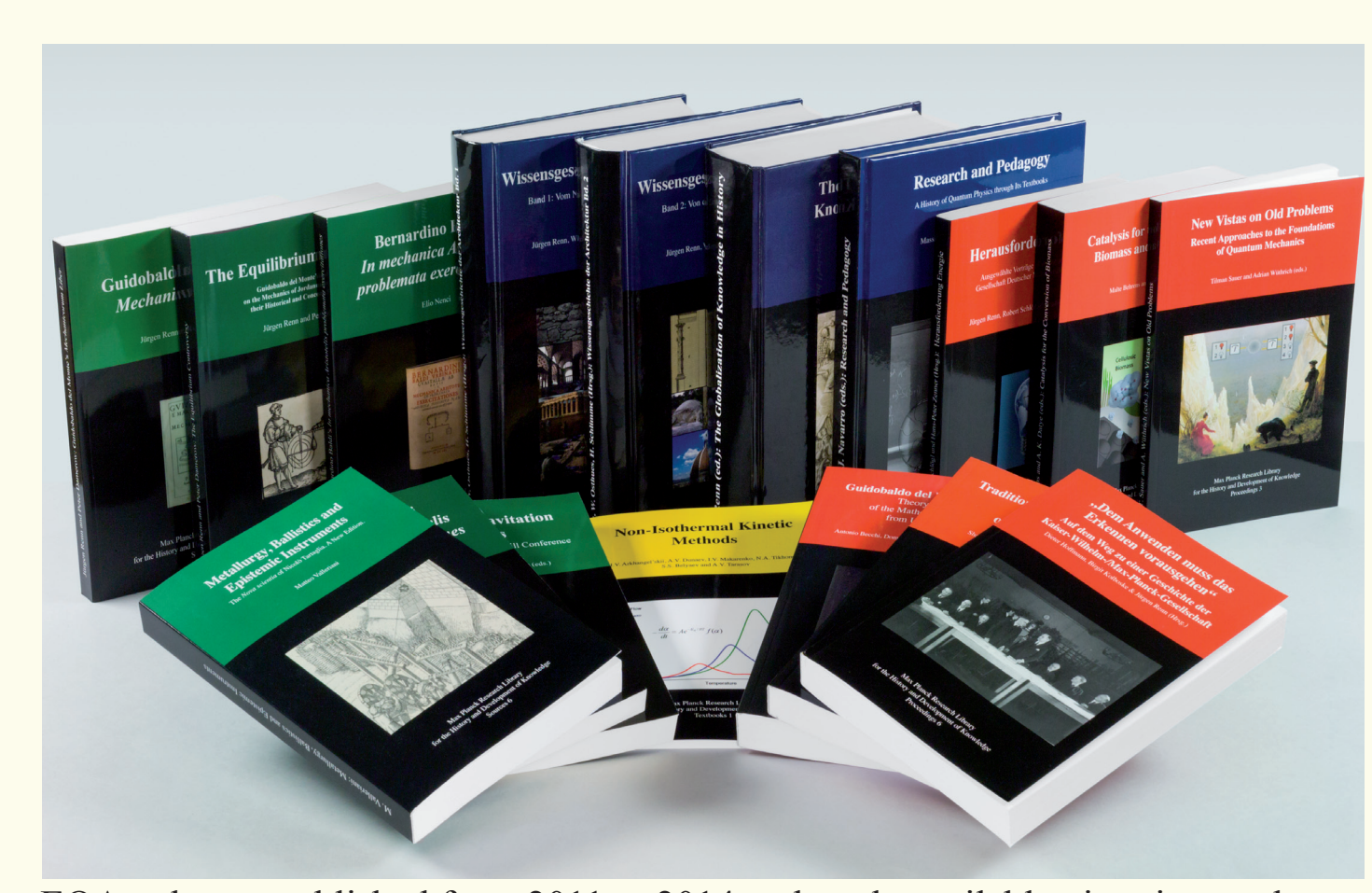
EOA volumes published from 2011 to 2014 and made available via print-on-demand in cooperation with epubli: http://www.epubli.de/buch/edition-open-access.

EOA volumes are published under the responsibility of an international editorial board. Board members are distinguished experts from several fields. Prior to publication, all EOA volumes are subject to a strict peer-reviewing process.