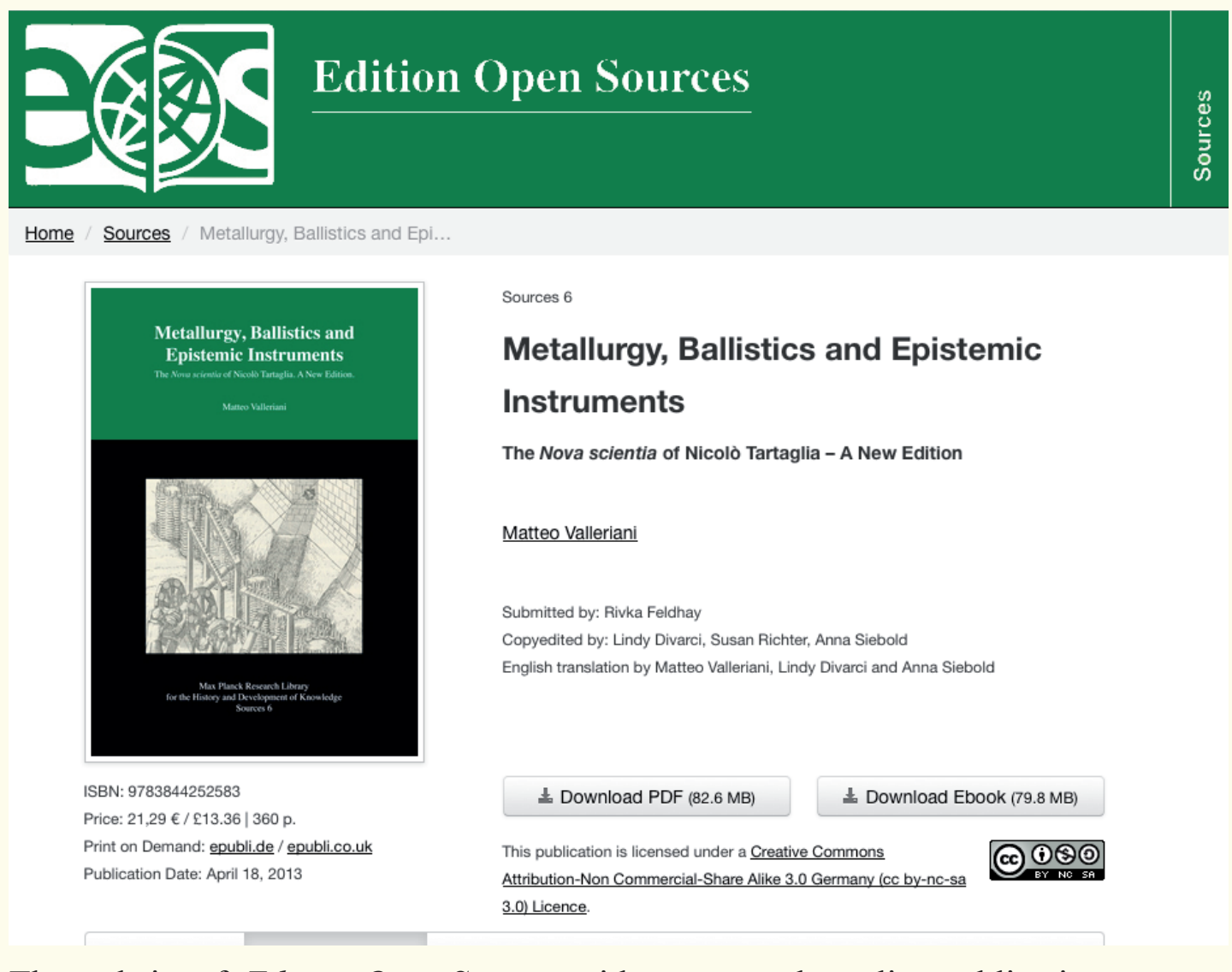
The website of Edition Open Sources with access to the online publications: www. edition-open-sources.org.