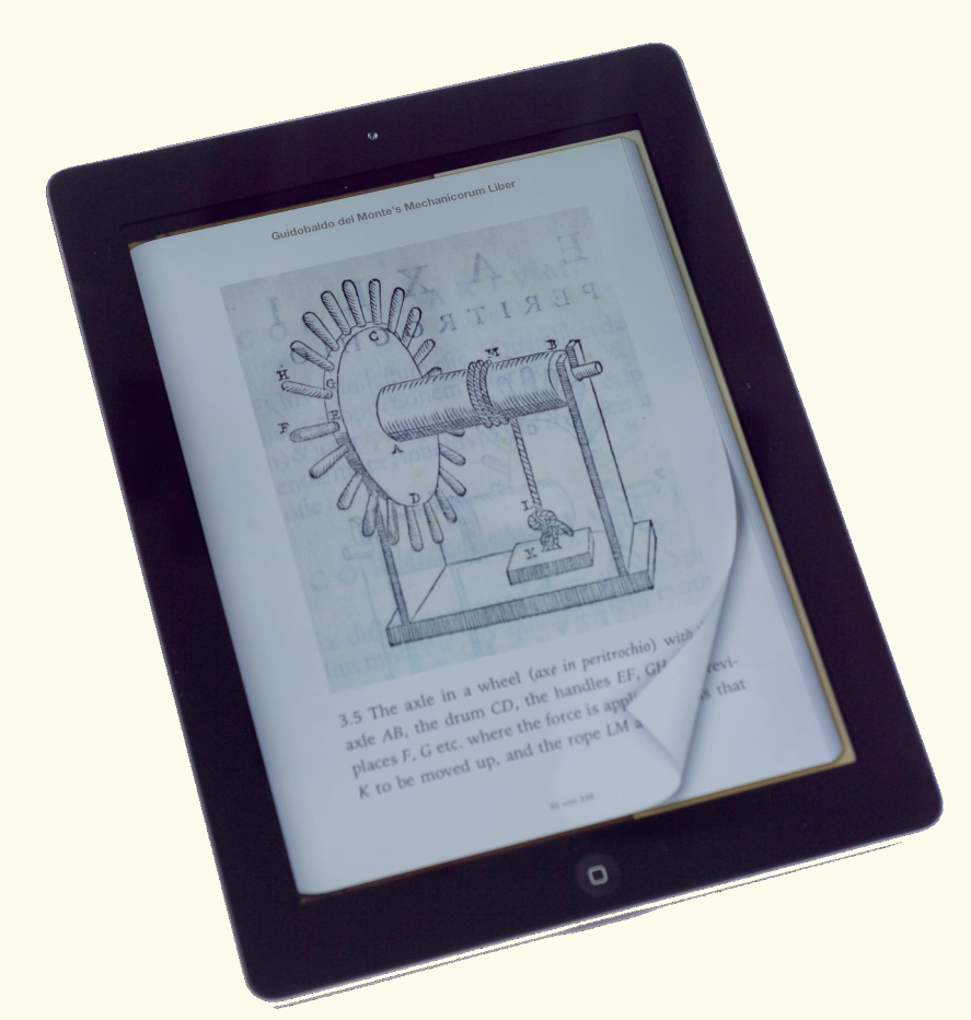
eBook version of an Edition Open Access volume viewed on a tablet device

EOA provides open access to publications in accordance with the Berlin Declaration on Open Access to Knowledge in the Sciences and Humanities, which was launched by the Max Planck Society in 2003. The aim is to disseminate the results of scholarly work to a broad audience rapidly and at low cost. The publications are freely available online as e-publications and additionally as print-on-demand books.